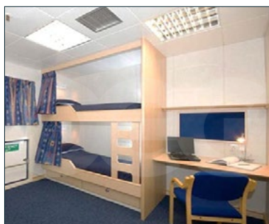
7.6m Accommodation Module