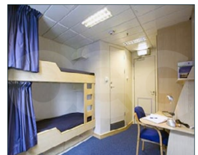
10.3m Accommodation Module