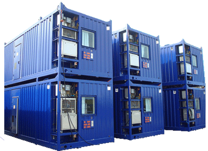
Offshore Accommodation Complex